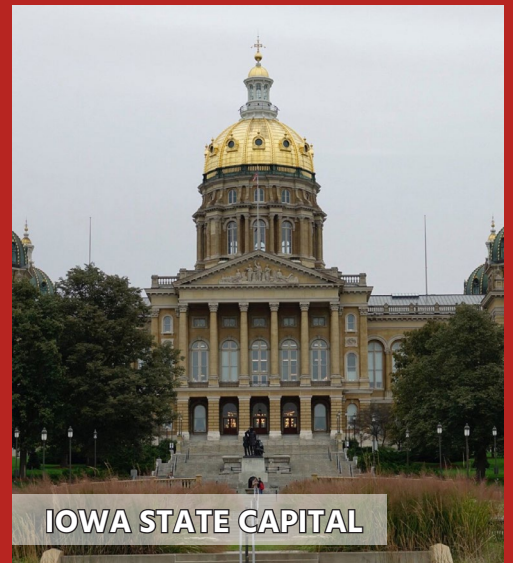
IOWA STATE CAPITAL