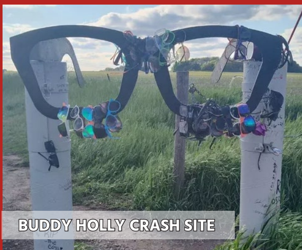
BUDDY HOLLY CRASH SITE