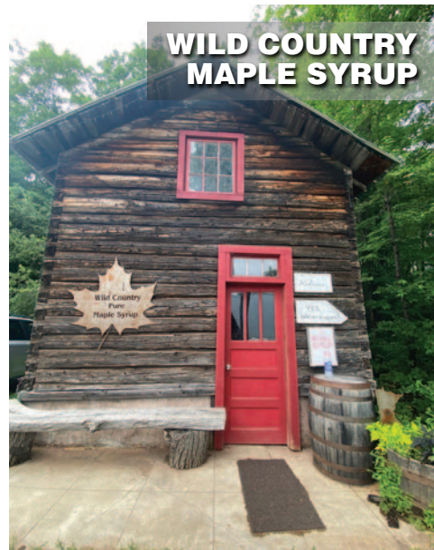
WILD COUNTRY MAPLE SYRUP