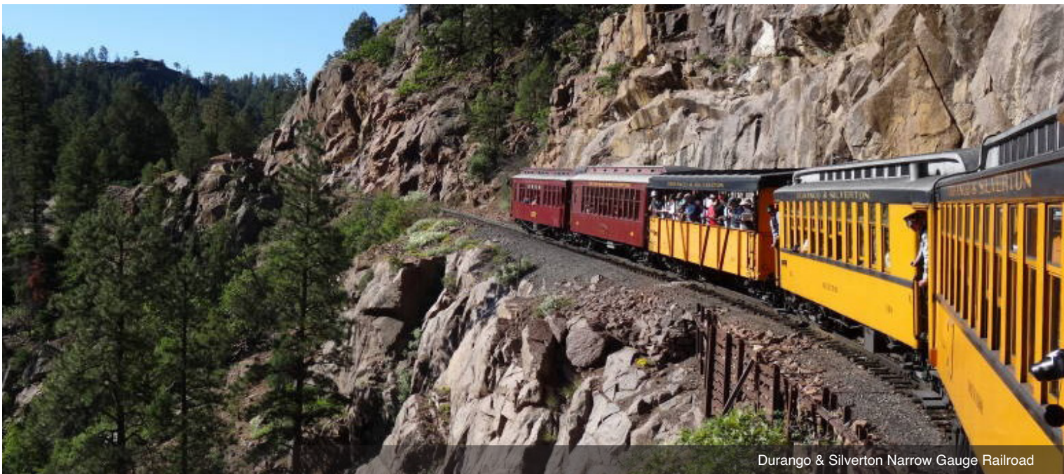
Durango & Silverton Narrow Gauge Railroad

DAY 6 Cumbres & Toltec Scenic Railroad: Your day begins as you board the motorcoach and ride to the Cumbres & Toltec Scenic Railroad, the original Rio Grande Line. This is America's most spectacular narrow gauge steam railroad. Explore 50 miles of wild and rugged territory between Chama, New Mexico and Antonito, Colorado, the highest point on the railroad. Meals: B, L