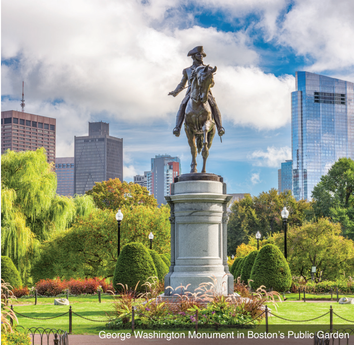
George Washington Monument in Boston's Public Garden