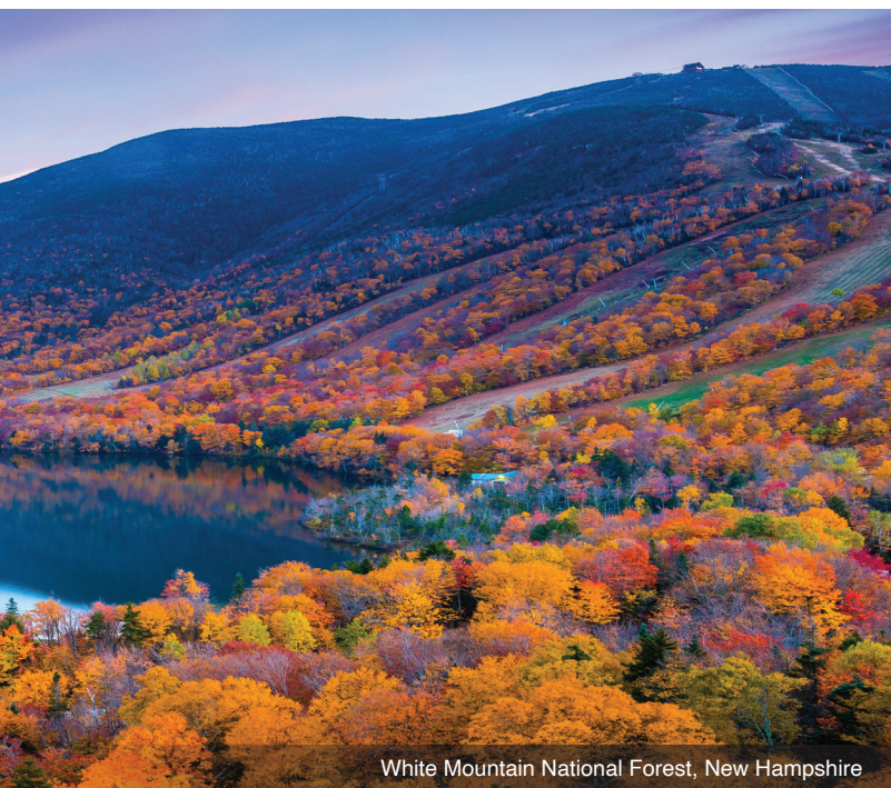
White Mountain National Forest, New Hampshire

DAY 8 Plymouth Rock and Whale Watching Cruise: Today pass through the state of Rhode Island, famous for its maritime history. In Plymouth, Massachusetts climb aboard your sea going vessel for a whale watching excursion. This naturalist guide-led cruise sails out to Cape Cod Bay and Stellwagen Bank, a marine sanctuary and primary feeding ground for Humpback, Finback, Minke and the endangered Right Whales. Pay a visit to Plymouth Rock where our forefathers first settled on American soil. Tonight, gather for a farewell dinner hosted by your Tour Manager. Meals: B, D