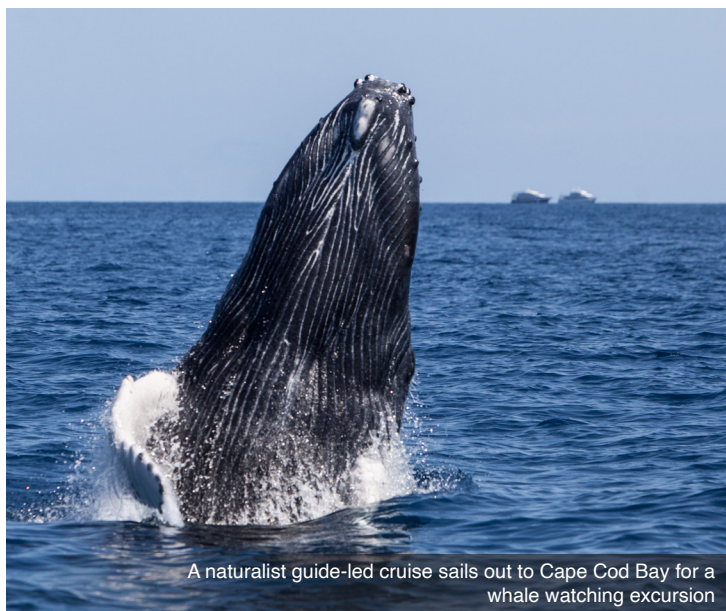
A naturalist guide-led cruise sails out to Cape Cod Bay for a whale watching excursion

DAY 9 Travel Home: This morning, take the group transfer to Boston's Logan Airport for flights out after 12:00 p.m. Meal: B